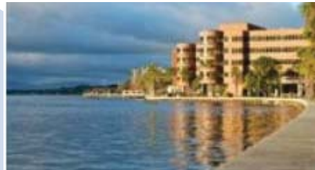
Community Hospice Center for Caring at St. Vincent's Riverside