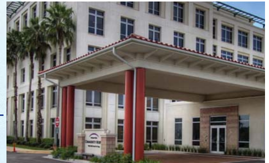
Bailey Family Center for Caring