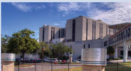
George and Margaret Morris Center for Caring