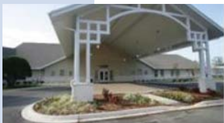
Dr. Gaston J. Acosta-Rua Center for Caring