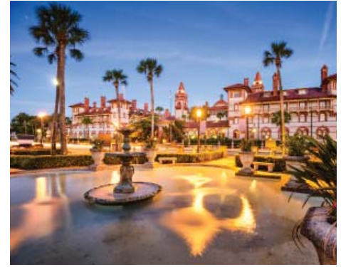
Historic Flagler College in adjacent Saint Augustine, Florida

the top ten U.S. cities to relocate to find a job. Jacksonville was also the 10th fastest growing city in the U.S. Jacksonville is home to many prominent corporations, including the headquarters of four Fortune 500 companies: CSX Corporation, Fidelity National Financial, Fidelity National Information Services and Southeastern Grocers.