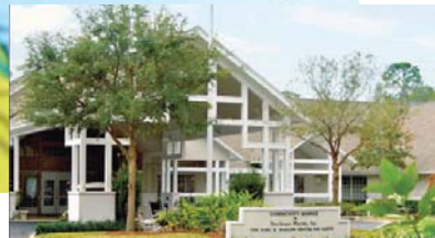
Earl B. Hadlow Center for Caring